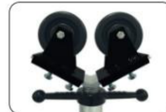
90032 - Phenolic wheel head