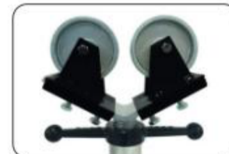
90060 - Steel wheel head