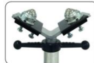
90000 - Ball transfer head